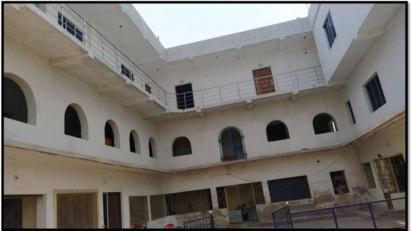
Girls Hostel :

Medical & other Facilities at Hostel: Available (One visiting doctor & staff Nurse)